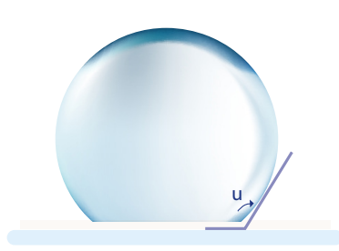
Siliconized surface: u > 95°